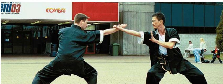
Master Wan teaching traditional kung fu seminars in England, 2003 尹师傅2003年在英国举行的座谈会上教导传统功夫